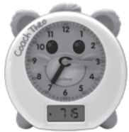
1 x wake up Coach Theo

When unpacking, ensure that the following parts are included: