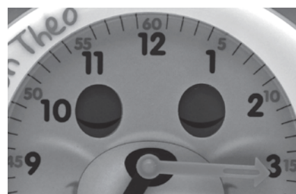
I close my eyes when it's time for bed