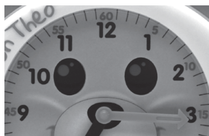
I open my eyes when it's time to get up