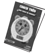
1 x instruction manual

WARNING: All packaging materials, such as adhesive tape, plastic sheets, strings and labels are not part of the product and should be discarded.