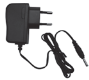
1 x power cable